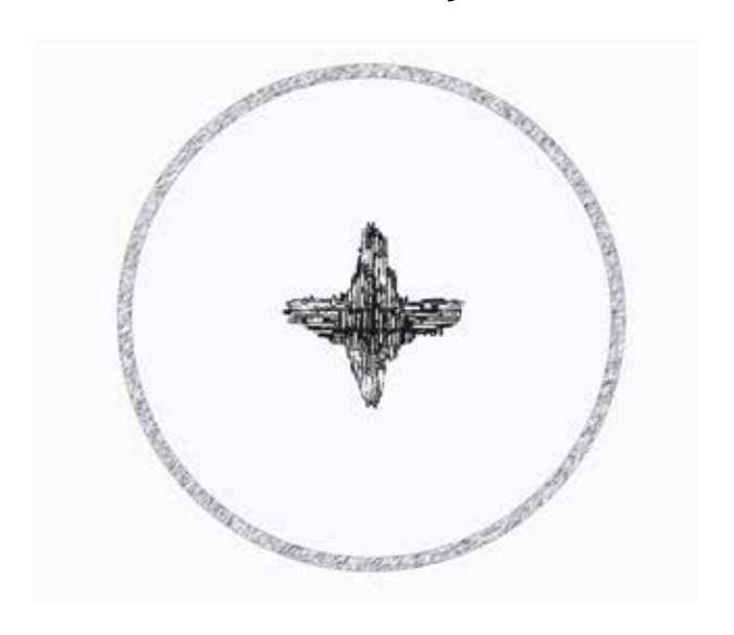
Sunday April 27th 2025 6pm